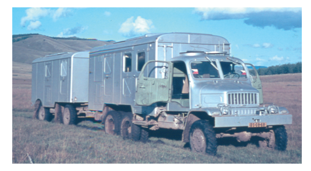
Figure 3. Czechoslovak mobile veterinary diagnostic laboratory with electric generator in Bulgan aimak (province) steppe.

service was at that time relatively well staffed and organized, and enjoying a respected authority.