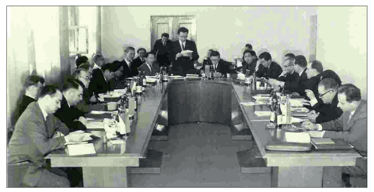
Figure 2. International scientific-methodological conference held in Ulaanbaatar, 4–12 March 1965, to finalize the project document for international expeditions against glanders, brucellosis and, tuberculosis in Mongolia.

and Mongolia as the host country. The conference finalized the details of diagnostic methods and procedures for specific disease control. All activity norms, lists of necessary equipment for international expeditions as well as the principles for their performance and management were elaborated in great detail. Due to harsh weather conditions it was agreed to limit the annual working period during 1966, 1967 and 1968 to six months, namely from April to September. It was suggested ands agreed that the expeditions work simultaneously in all 16 aimaks (provinces) covering the entire Mongolian territory divided as indicated in Table 1.